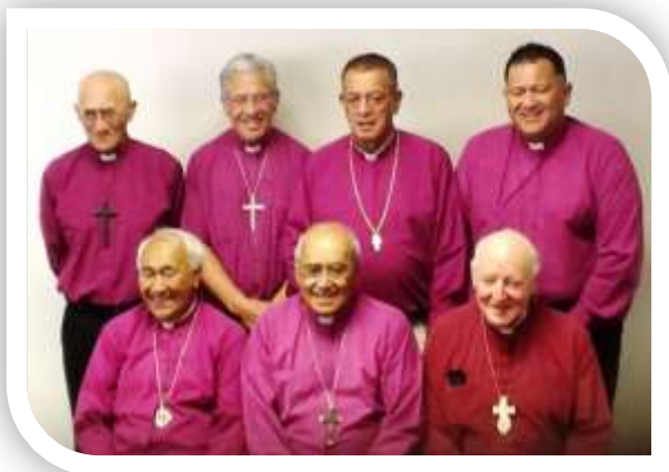
TE RUNANGANUI O TE PIHOPATANGA O AOTEAROA was held 7-10 November 2013 in Gisborne New Zealand