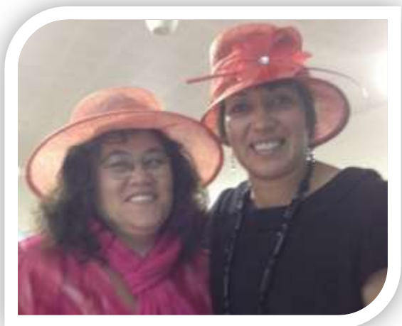
KAHUI WAHINE SUPPORTS PINK HIGH TEA

587 Elizabeth Street, Redfern NSW 2016 Ph: 0424553579, www.tewairuatapu.com.au