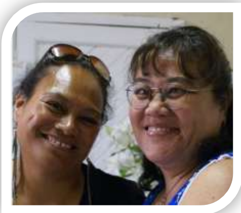
KURA RATAPU welcomes your children